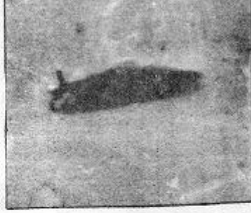
Quote from Major Raymond Nye, Selfridge Air Force Base

They may soon be published in book form. Readers are advised to keep in contact with the "Fountain Journal" for latest news of this unique collection of genuine UFO pictures, soon to be released.