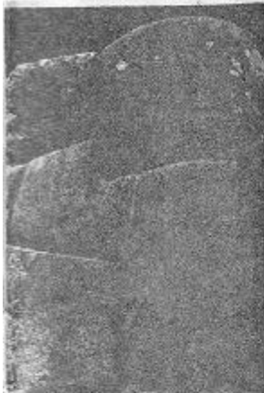
Left. Part of the walls at Sacayhuaman. Could untrained, primitive peoples have placed these great stones together in such an arrangement?

XXXXXXXXXXXXXXXXXXXXXXXXXXXXXXXXXXXXXXXXXXXXXXXXXXXXXXXXXXXX