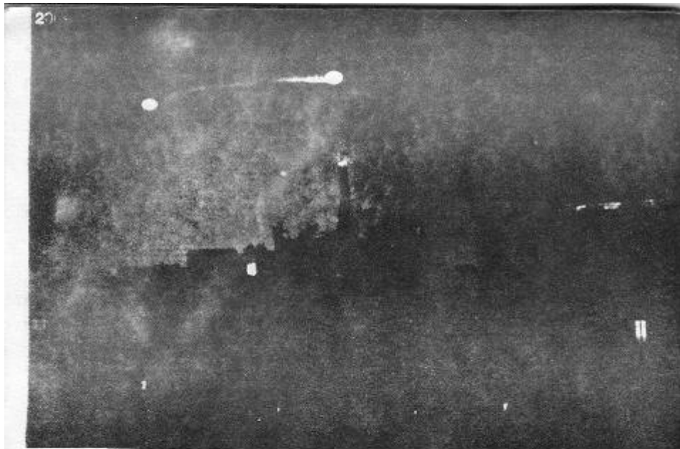
Above: Photograph of a luminous disc taken by engineer M. Paul Paulin at 3.45am. During the two-minute exposure, this saucer, which had been immobile, jumped sideways and then again hung motionless between the Eiffel Tower and the Parc des Expositions, Paris.