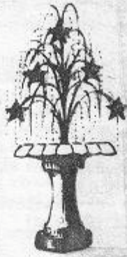
THE FOUNTAIN CENTRE