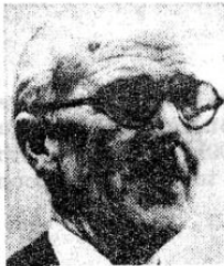
Air Marshal Goddard: "I suppose sex comes into everything nowadays."

The men from outer space could be 'beaming in' on your intimate moments